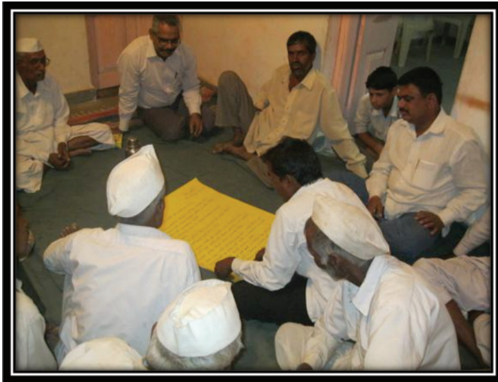
Fig. 4: Meeting with bullock owners on content of snake and ladder game

cart races, shearing of bullocks horns and painting them using harmful lead containing oil paints etc.